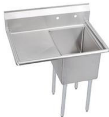
Floor Mounted Mop Sink: