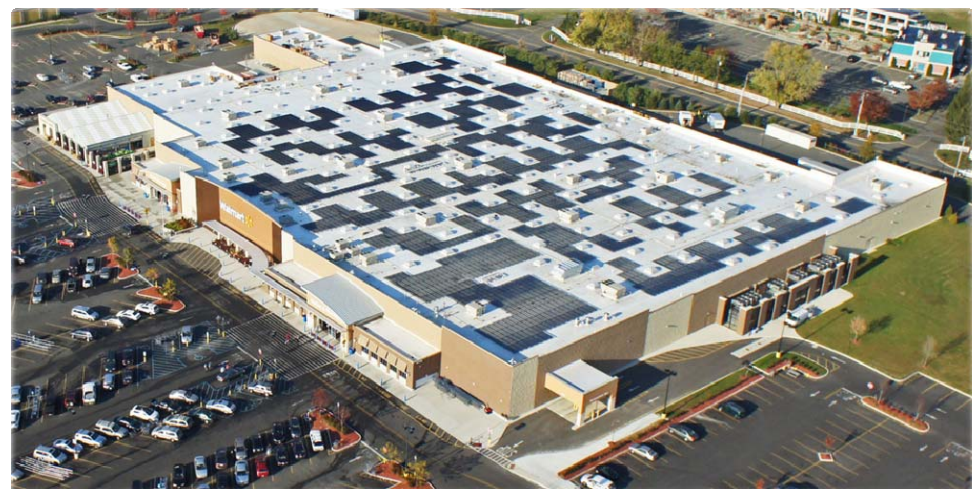
The new Longview Walmart is 30,000 square feet.