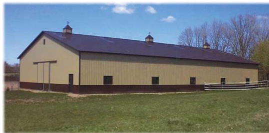
This riding arena is 7,560 square feet.